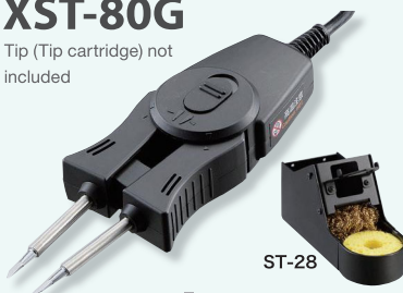
Soldering Tweezers Stand ST-28 Front Opening of the Tip Cartridge ST-28MS