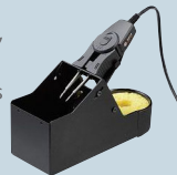
Soldering tweezers stand ST-28

High-accuracy design with minimum tip deviation. Easy replacement of hot tips without any other tools.